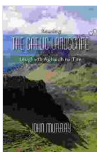
Image Alt Text: A breathtaking panoramic view of the Scottish Highlands, showcasing rugged mountains, tranquil lochs, and vibrant greenery. The image captures the essence of Scotland's stunning natural beauty.

Embark on an unforgettable adventure today with "Reading the Gaelic Landscape"!