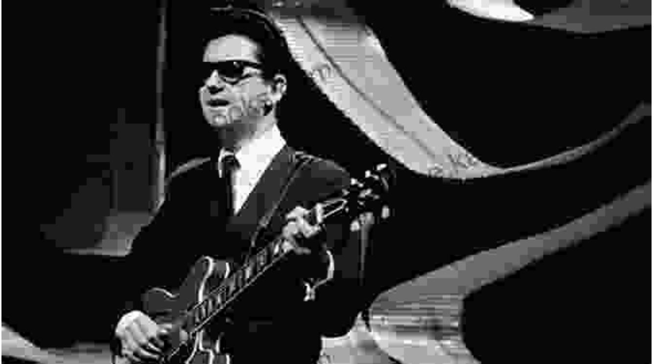
Roy Orbison in concert

Orbison's success in the United States soon spread overseas. He toured extensively in Europe and Asia, captivating audiences with his electrifying live performances. His dark sunglasses, which he adopted to conceal his shyness onstage, became an integral part of his enigmatic image.