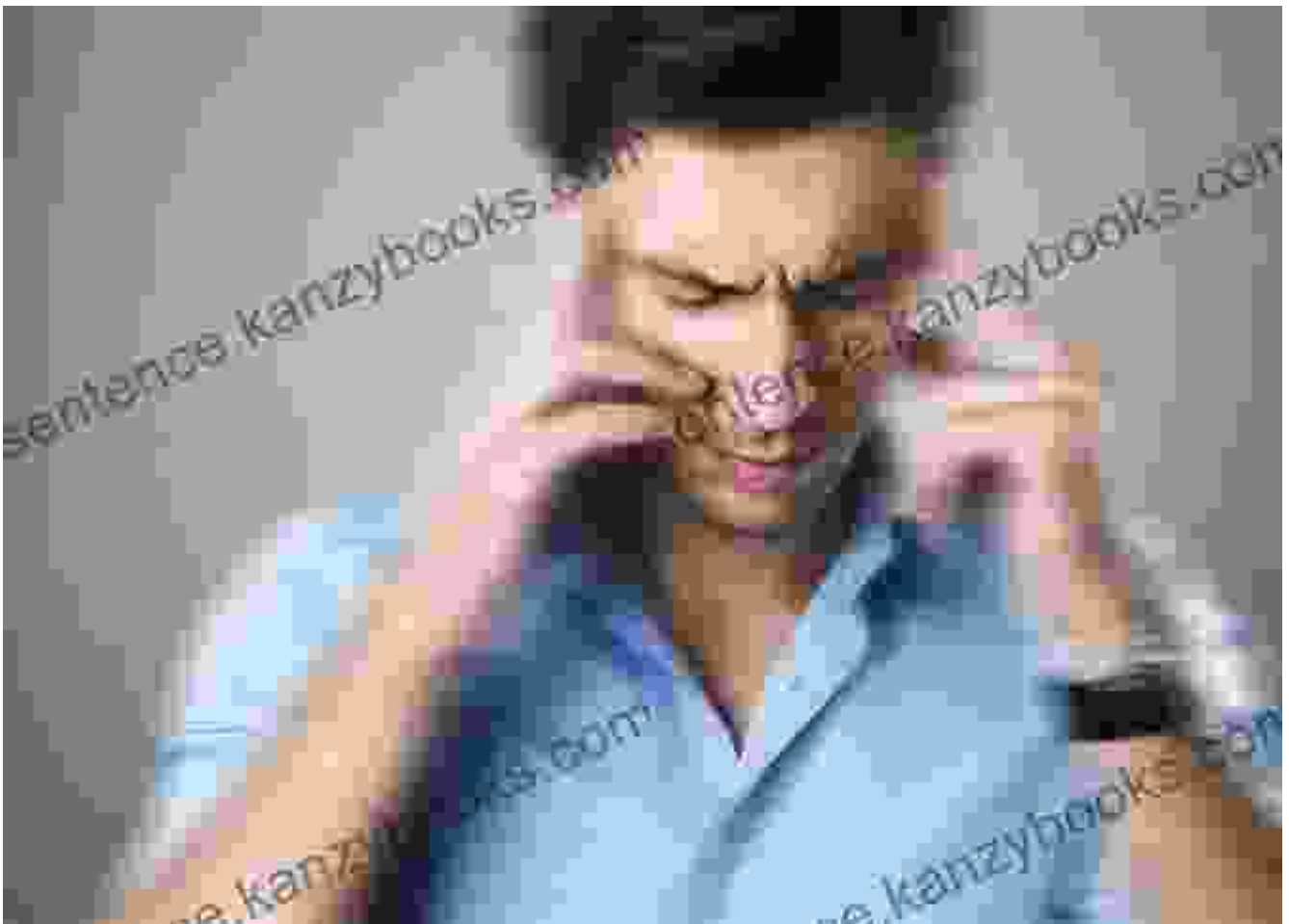
A person experiencing a vision

Visions are experiences in which a person sees or hears something that is not physically present. Visions can be religious or secular in nature.