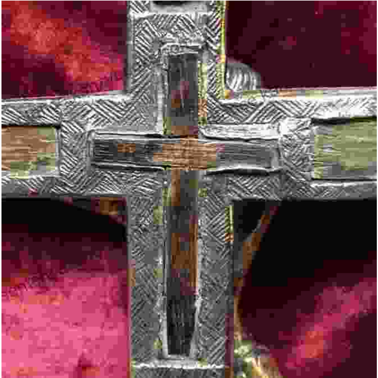
A relic of the True Cross

Relics are physical objects that are believed to have been associated with a saint or other holy figure. These objects can include bones, hair, clothing, or even objects that have been touched by the holy person.